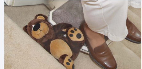
Safety Obstruction Sensors

Other Pinnacle perks include standard features such as: