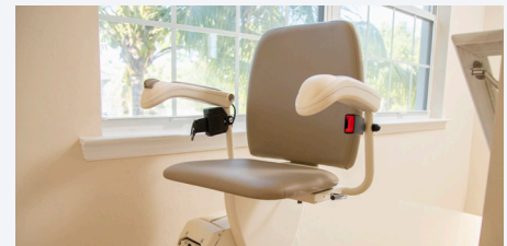
Powered or Manual Swivel Seats for Safer Exits